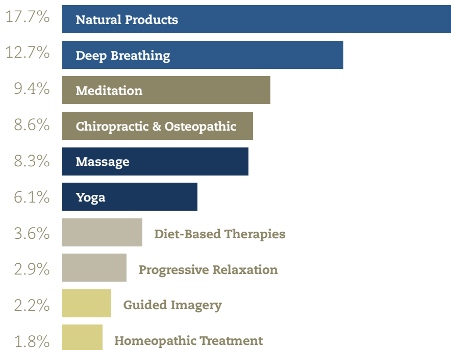
Source: Barnes PM, Bloom B, Nahin R. CDC National Health Statistics Report #12. Complementary and Alternative Medicine Use Among Adults and Children: United States, 2007. December 2008.