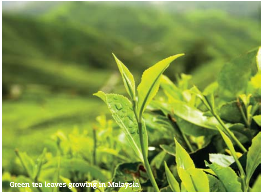
Green tea leaves growing in Malaysia

"I really like this research. Once you start working with these compounds, you meet other people that are interested in it. So you start hearing of other things that could be interesting to try, and gradually you end up doing more and more."