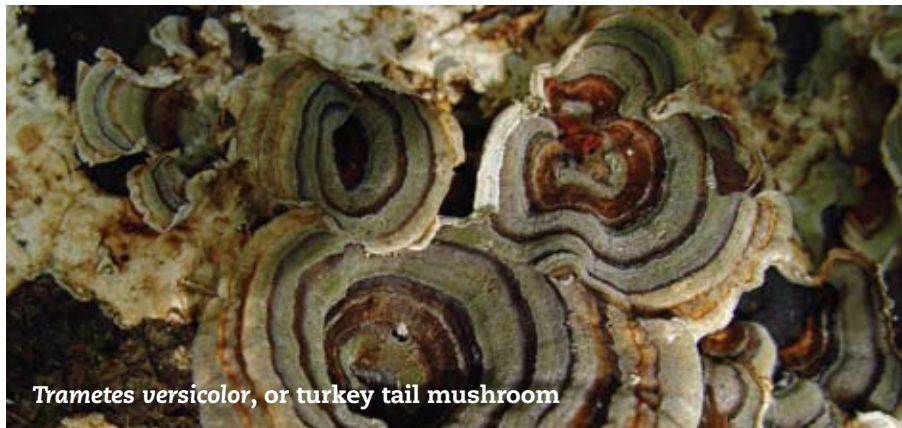
Trametes versicolor , or turkey tail mushroom

Price: Natural products, which include the mushrooms and other botanicals, are very complex systems; they have many, many different constituents or components in them. Western science is done essentially by compartmentalization: let's take one component or one constituent and see what it does to the cell or to the receptor. With natural products research, you're looking at hundreds of constituents and their effects, and you can't control things as well as with Western science; you have to run a lot of additional controls. So another career goal for me is to work on improving the scientific models for looking at natural